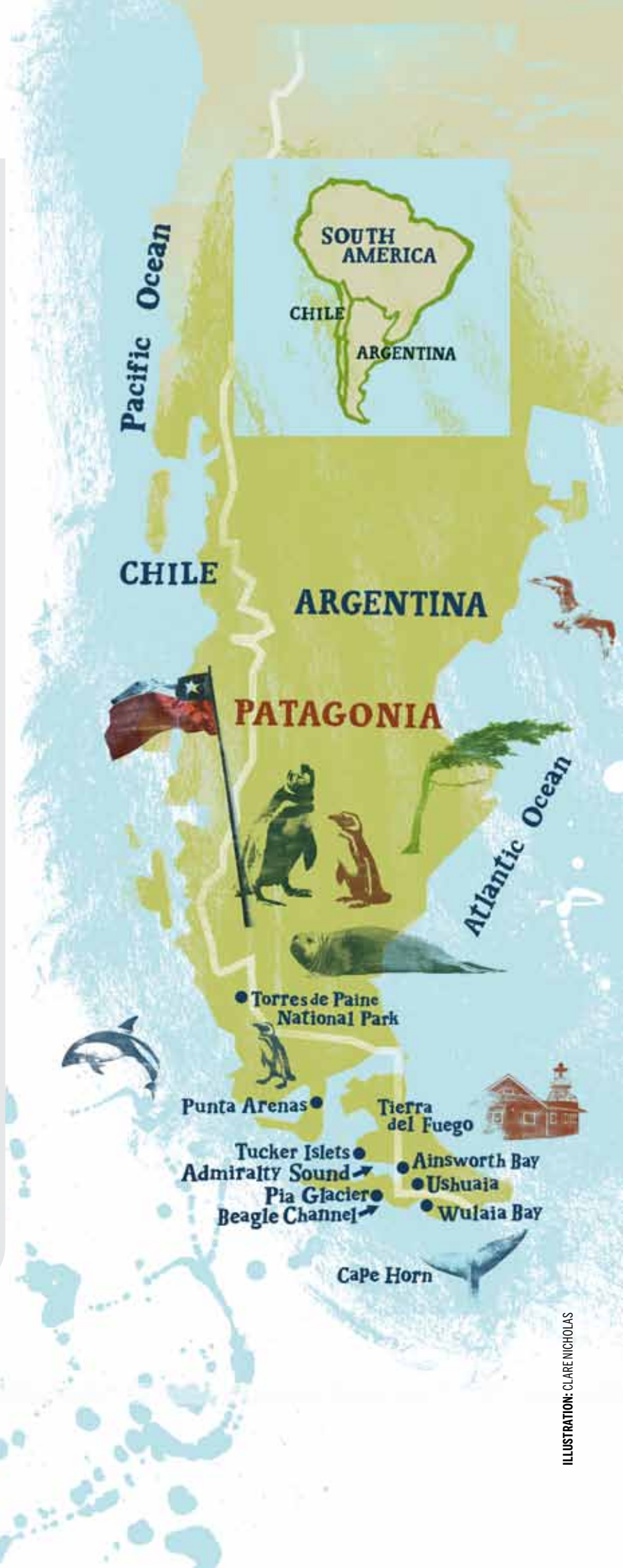
ILLUSTRATION: CLARE NICHOLAS